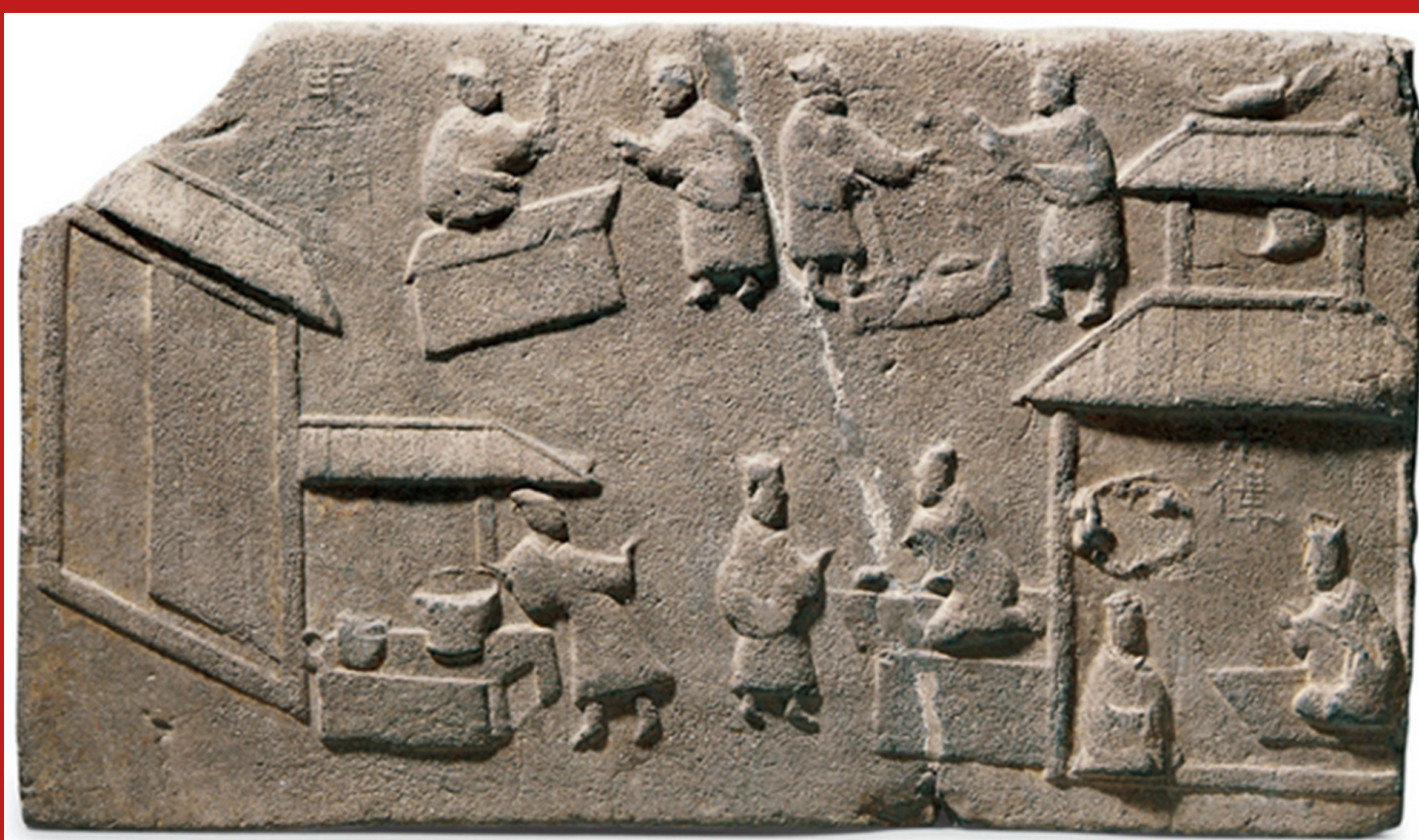
Stone tile with relief depicting a market scene from the Eastern Han Dynasty (25-220 CE), Sichuan Province, 28x48 cm, between 25 and 220 CE